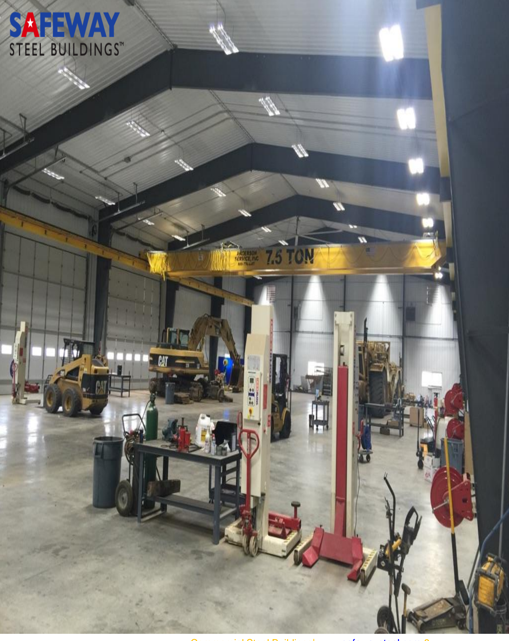
Commercial Steel Buildings| www.safewaysteel.com 8